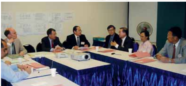
Fig. 13. Examiners' Meeting at the 1 st Conjoint MMed / MRCOG Examination held in KK Women's and Children's Hospital on 8 May 2006.