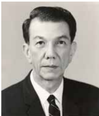
Fig. 1. The late Professor BH Sheares, Protem Chairman of the Chapter of O&G in 1969.