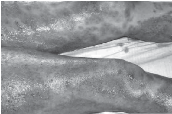
Fig. 1. Widespread erythematous plaques and erosions over the lower limbs of the patient.