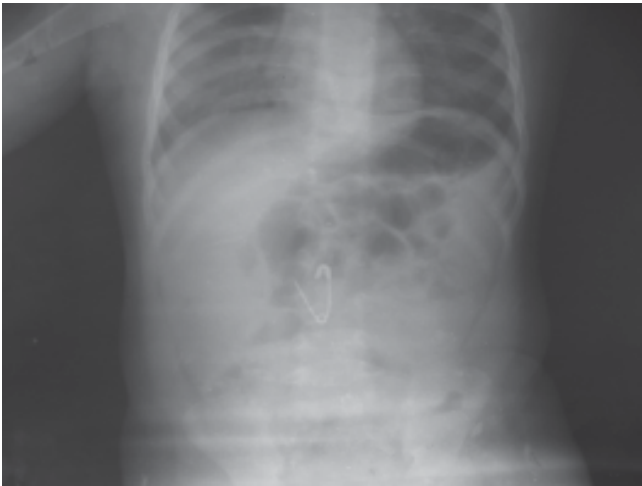
Fig. 1. Abdominal plain roentgenogram revealed an open end safety-pin, which was located in the upper abdomen.

in the oesophagus, endoscopic removal is indicated. For objects in the stomach, a 2-month waiting period is recommended; for objects located in the lower gastrointestinal tract, a 15-day wait before laparotomy is indicated. Most reports agree that observation until the patient becomes symptomatic is the best approach for the management of foreign body ingestion. In fact, James et al 8 reported several cases in which foreign bodies had been in place for up to 3 years with no complications. We waited for 3 months because the patients did not have any clinical symptoms urging surgical intervention and with the expectation that the safety pin would be expelled.