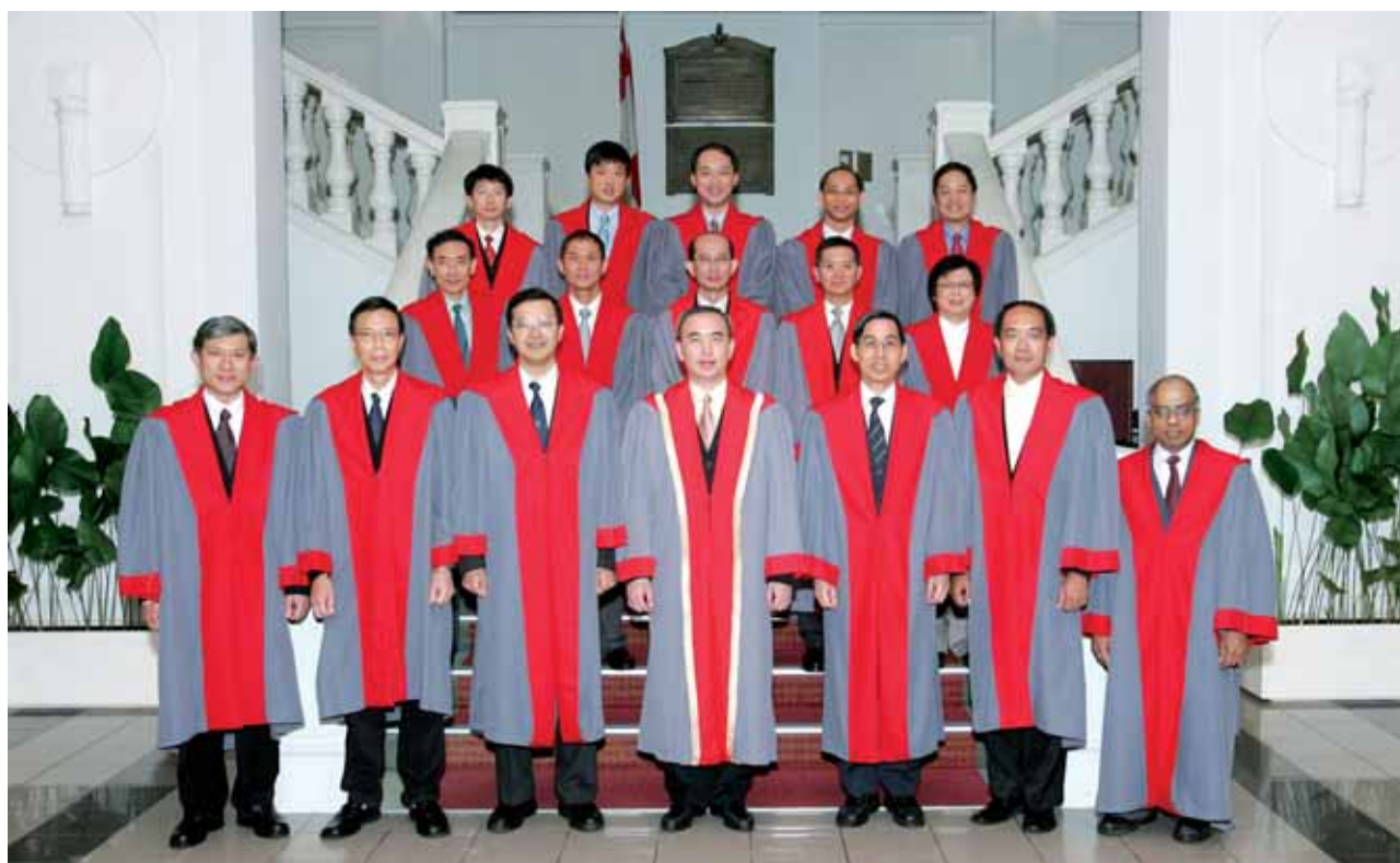
Fig. 4. Interim Council of the College of Physicians, Singapore.

After the College was officially incorporated on 17 th August 2004, nomination, election and appointment of College Council members, President, College Office Bearers, 14 Chapters' Chairmen and the respective Chapter Specialty Board members were carried out. An elected Interim Council took office at the College's First Annual General Meeting on 28 th June 2005 (Table 3) (Fig. 4).