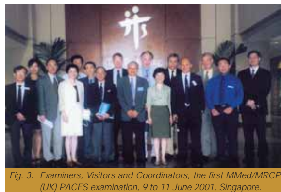
Fig. 3. Examiners, Visitors and Coordinators, the first MMed/MRCP (UK) PACES examination, 9 to 11 June 2001, Singapore.

It is worthy to note that the first ever Practical Assessment of Clinical Examination Skills (PACES) of the MRCP (UK)/MMed (Int Med) was held in Singapore from 9 to 11 June 2001, even before they were held in centres in the United Kingdom (Fig. 3).