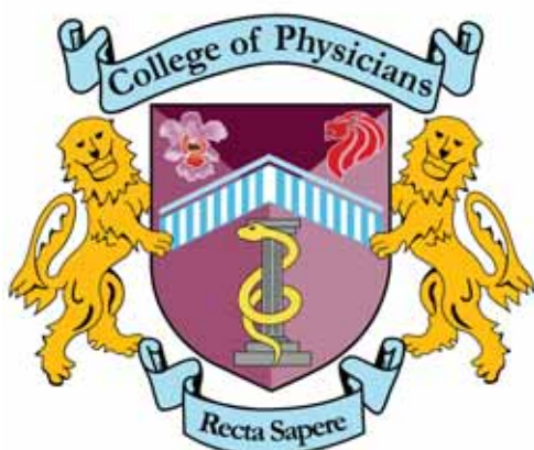
Fig. 12. Coat of Arms of the College of Physicians, Singapore.

The Coat of Arms of the College (Fig. 12) consists of a shield supported by 2 lions on each side. The lions represent Singapore and dauntless courage. Within the shield, the Chevron symbolises the coming together of the specialties of internal medicine under one roof - the College. The 16 bars in the Chevron represent 14 current and future chapters. The column represents fortitude and constancy, with a serpent coiled around it, representing wisdom with fortitude. The orchid Vanda Miss Joaquim is Singapore's national flower. Its hardy and resilient qualities and its ability to bloom throughout the year are the characteristics which reflect our quest for progress and excellence. The Singapore's Lion Head symbolises courage, strength, as well as resilience in the face of challenges. On top of the shield is a banner with the wordings "College of Physicians". Below the shield is a banner inscribed with the Academy of Medicine, Singapore's motto, "Recta Sapere", which urges us to seek and savour the truth at all times.