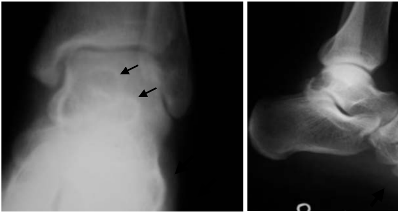
Fig. 1a. Radiograph showing lytic area in the talus (arrows) with sclerotic margins.